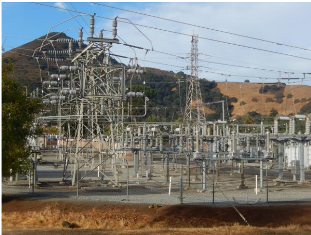
Morgan Hill Substation